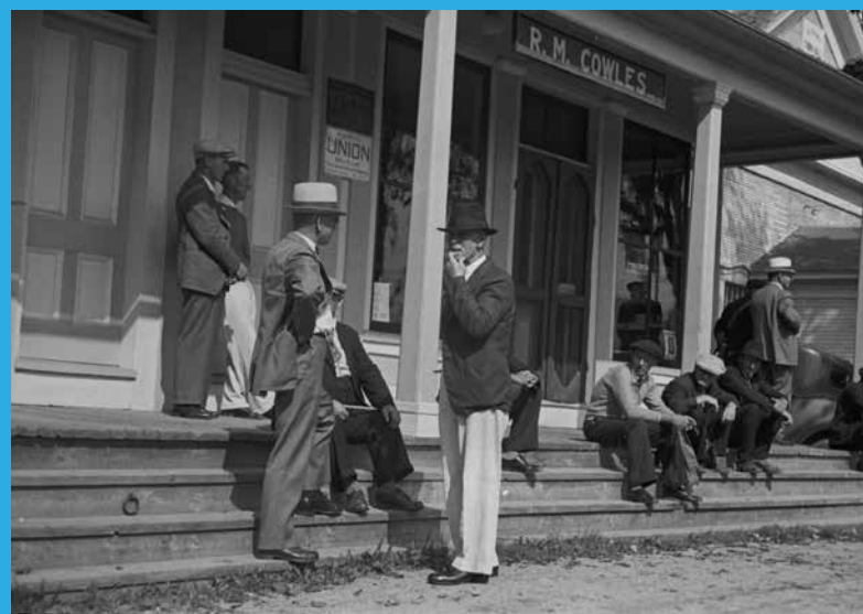
Cowles Store, September parade 1936

"On the right side is a long counter extending the length of the store. On the counter is a display case showing small articles and notions such as ladies' side combs, collars, ribbons, jewelry, hair pins, etc...Back of this counter on shelves, are corsets, sewing thread, yard goods, and underwear for men, women and children... At a counter across the back we find a large coffee grinder operated by a hand-powered crank...St. Johnsbury crackers were here, selling for 25 cents a box...A whole round of cheese was here to go with them, ready to be cut to specified weights... Salt fish- cod, salmon, and sometimes mackrel- were in barrels or casks of brine...A counter beyond the coffee mill held a candy showcase ...The spruce gum was the real thing brought in by farmers and wood-choppers...The outside of Cowles Store was not impressive, but this little store supplied us with our daily needs... Here many issues of the day were hashed over, argued and settled. Here the local gossip was heard and discussed, and men present at the assembly spat tobacco juice from the steps. The porch and steps were also very useful when viewing parades, and were always well patronized for such events."